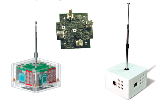
Figure 1: MSP410 Sensor Board and Package

The MSP410 is enclosed by a 3.5" x 3.5" x 2.4" box made of molded plastic. The bottom of the package is detachable for battery replacement, and a retractable antenna stems from the top. The holes for the acoustic circuitry are protected with a moisture resistant windscreen, and the PIR windows are covered with a solid film that is transparent to infrared.